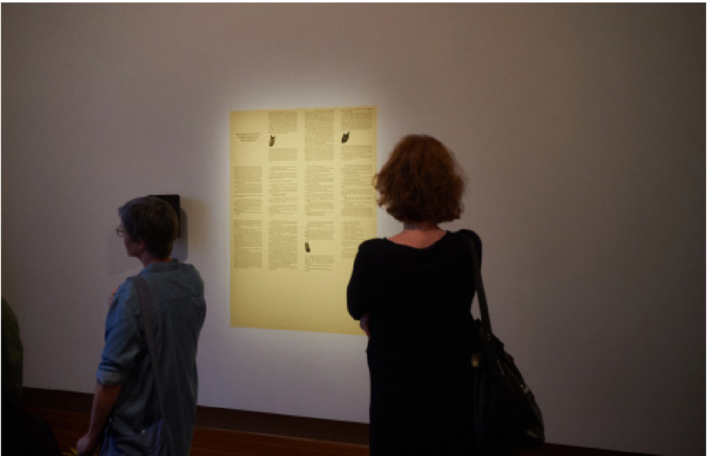
Somewhere in Between, Bozar, Brussels, 2018.