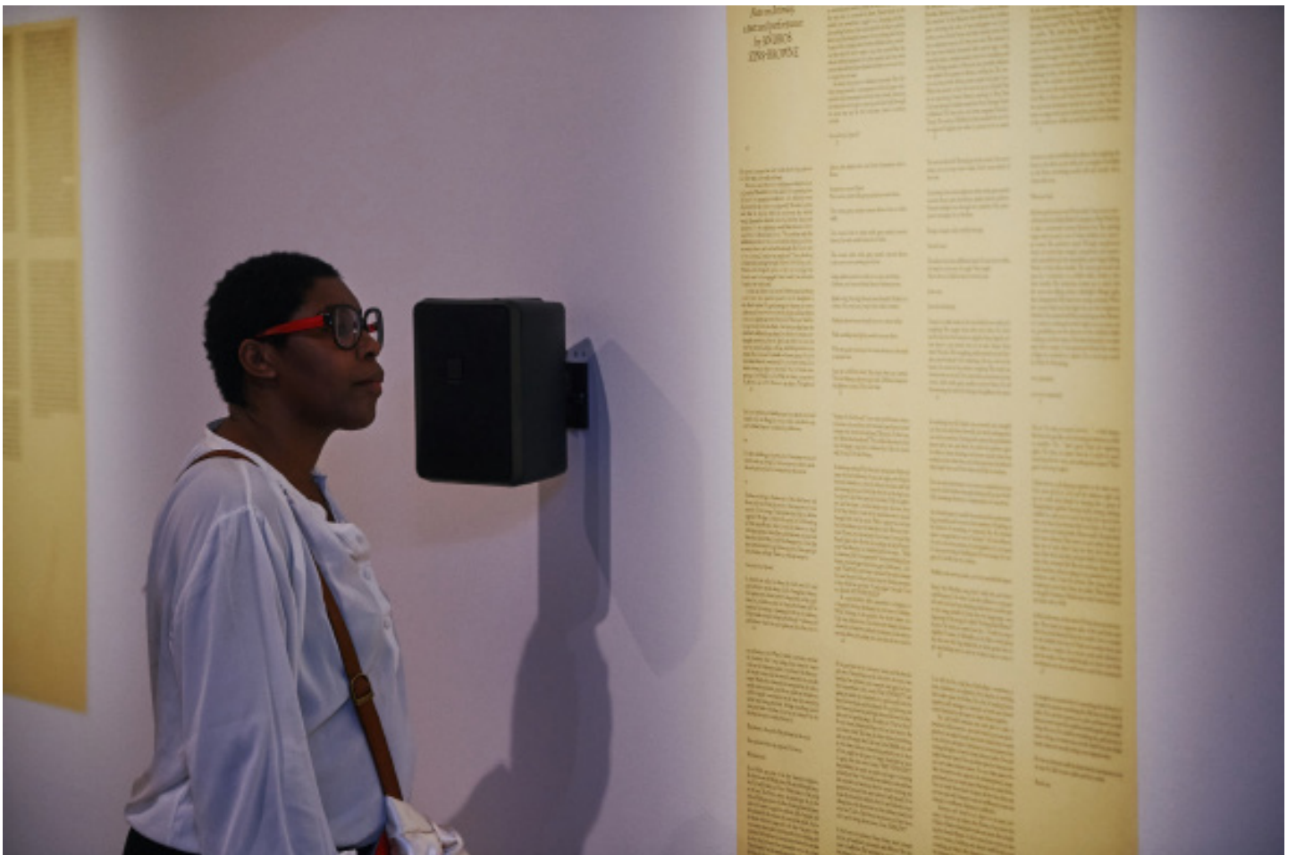
Somewhere in Between, Bozar, Brussels, 2018.